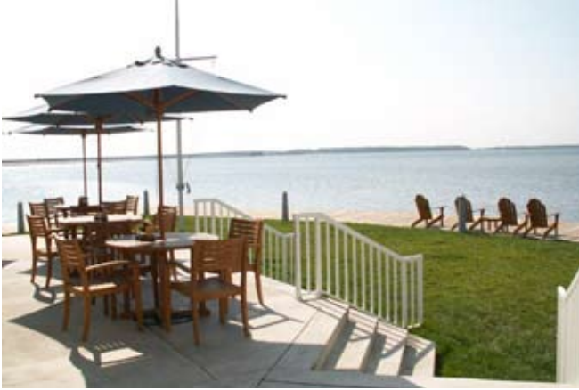
The expanded Island Time Cafe features bayside and poolside dining seven days a week. Look for new lunch items and an expanded dinner menu this summer.

Look for coconut margaritas, fresh tuna and an expanded wine selection at the Island Time Café this summer. The Café has undergone major renovations in the off-season starting with a complete overhaul of the kitchen. "We're adding a high-end commercial grill,